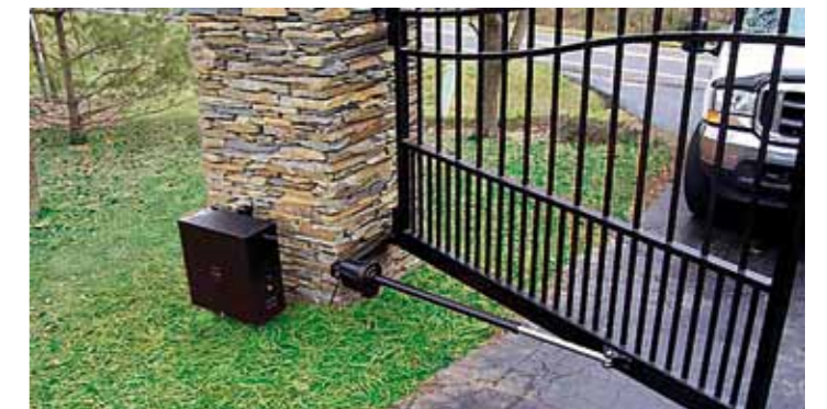
A safe choice, reliable in any condition. Sturdy, for swing gates up to 600 lbs and 16 ft.