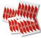
WA10 Red adhesive reflector strips.