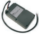
PS224 24 Vdc battery back-up.