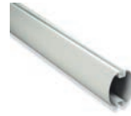
XBA5 White paint-finished aluminium bar 2.7x3.6x202.7 inches.