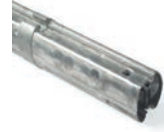
XBA9 Expansion joint.