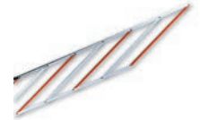
WA13 Aluminium rack up to 6.6 ft.