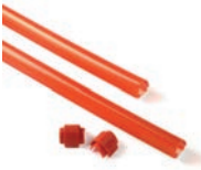
XBA13 Rubber impact protection strip. Length 3.3 ft.